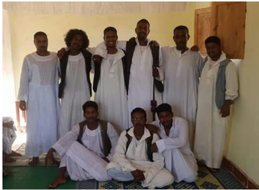
Nubian Men costume "Arragy"

Traditions are part of daily life of Nubian people who enjoy practicing it everywhere as in their costume, wearing traditional henna on women hands and feet as well as making braids. Its also saluted in their celebrations as in weddings or child birth.