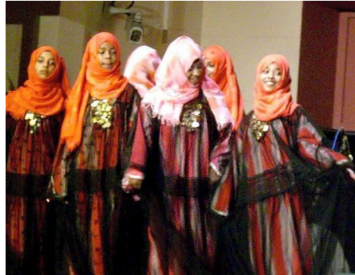
Nubian Women costume "Gergar"