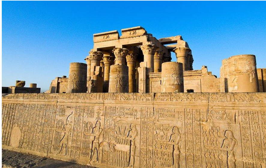
(5) Temple of Horus at Edfu